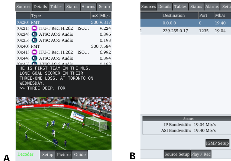
FIGURE 4 Bit-Rate Examples: Left Program Right Stream

From a system engineer's point of view, an essential measurement is the bit rate of each PID, each program, and total stream bit rate. Nearly every commercial and non-commercial station today emits a multi-program stream; per ATSC (& FCC) standards the total stream bitrate cannot exceed 19.4Mb/s. The IPQ measure and displays in both its Details Screen (Figure 4A) and Sources screen (Figure 4B). This measurement is used when verifying the configuration of the broadcast encoders and stream multiplexor.