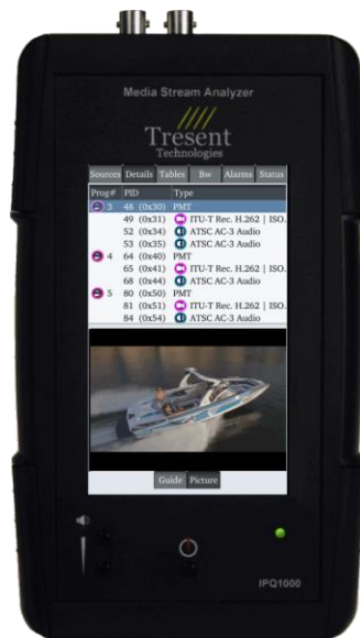
FIGURE 1 IPQ-1000 Media Stream Analyzer

Recent development has produced various standards for moving DVB-ASI over IP, therefore enabling interface of broadcast streams into an IP network. This protocol has proven very effective in moving the broadcast DVB-ASI stream from the physical plant over common carriers to cable TV and satellite distribution networks.