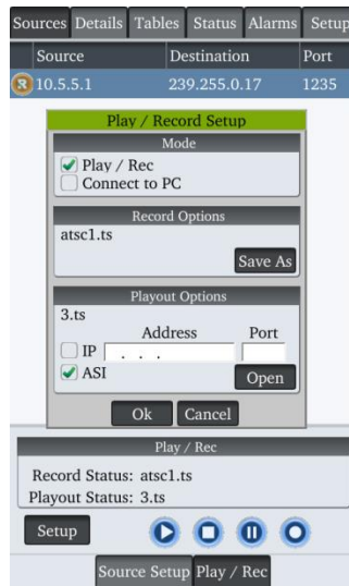
FIGURE 6, Stream Recorder Screens

The IPQ has transport stream recording capabilities. This feature was found to be very important. As the IPQ will be used by many field technicians, they may not always understand the entire complexity of the stream. Also for troubleshooting intermittent issues recording the stream is very helpful.