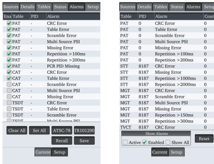
FIGURE 5, Alarms Set-Up and Alarms reporting Screens

Referring to Figure 2, the IPQ has 'loop-through' inputs for both DVB-ASI and Gig-E. Connecting the IP in circuit does not require any additional hardware while providing the information about the actual stream under test. For this application the IPQ may be placed in an IT closet and used to monitor in-bound or out-bound streams while creating and logging alarms.