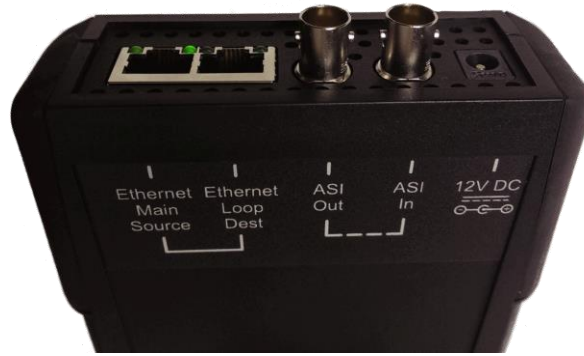
FIGURE 2, Connector Surface, Gig-E and DVB-ASI loops

In looking for a tool to verify DVB-ASI in both transport stream and IP, I found the Tresent IPQ-1000 (aka “IPQ”). The IPQ is very portable, does not require any outboard hardware, and analyzes both ASI and IP streams. Traditional stream analyzers are usually found in the form of an I/O card in a PC or a laptop with a USB device; either running software driving the ASI interface device. The form factor of these devices are not usually ‘really portable’. The IPQ is powered by a battery or conventional 120 VAC. It can be connected to any hardware in the facility directly, the back of a rack, IT closet etc.; or moved easily to the transmitter facility or local CATV headend.